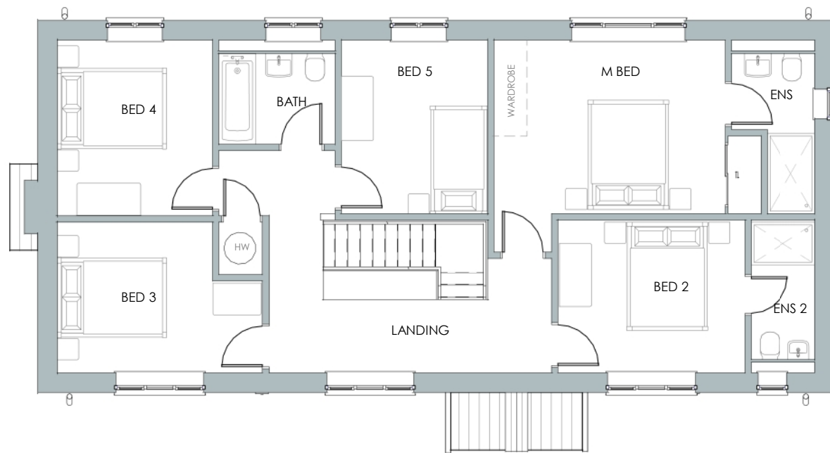
L2 First Floor Level