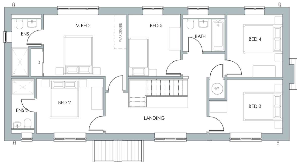
L2 First Floor Level